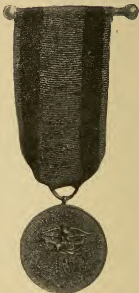
United States Army INDIVIDUAL SERVICE MEDAL